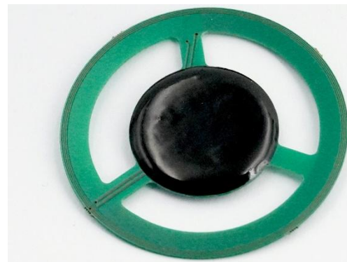
TEL +49-361-59874 0 This data sheet is subject to change. E-MAIL info@microsensys.de Picture may differ from original product. WEB www.microsensys.de Document Revision 002

TELID®200 RFID sensor devices are a core element of microsensys' innovative iID® system solution, delivering high-precision, contactless measurements even in challenging environments. These intelligent sensors are engineered for robust performance, combining durability with reliability to meet the demands of industrial and particularly construction applications. Thanks to their battery-free architecture, TELID®200 sensor transponders enable maintenance-free operation, reducing service requirements and supporting long-term, sustainable deployment.